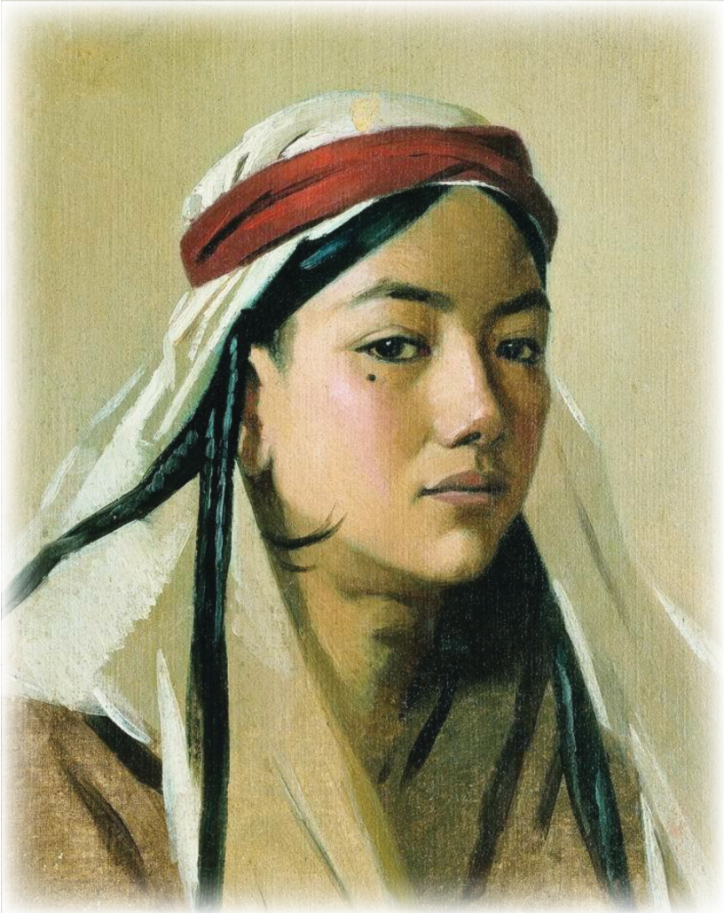
Baccha, Vasily Vereshchagin

The Tura continues to rebuild the city, shoring up the citadel he himself just breached, paying off the mercenaries who helped him, and strutting about as if he were a fabulous hero. I do not know why you had me help him; I regret it already. But I do as you command, my lord; your vision exceeds mine, even if your vantage point is distant Tehran and I float directly above the little Khanates you have taken such an excessive interest in.