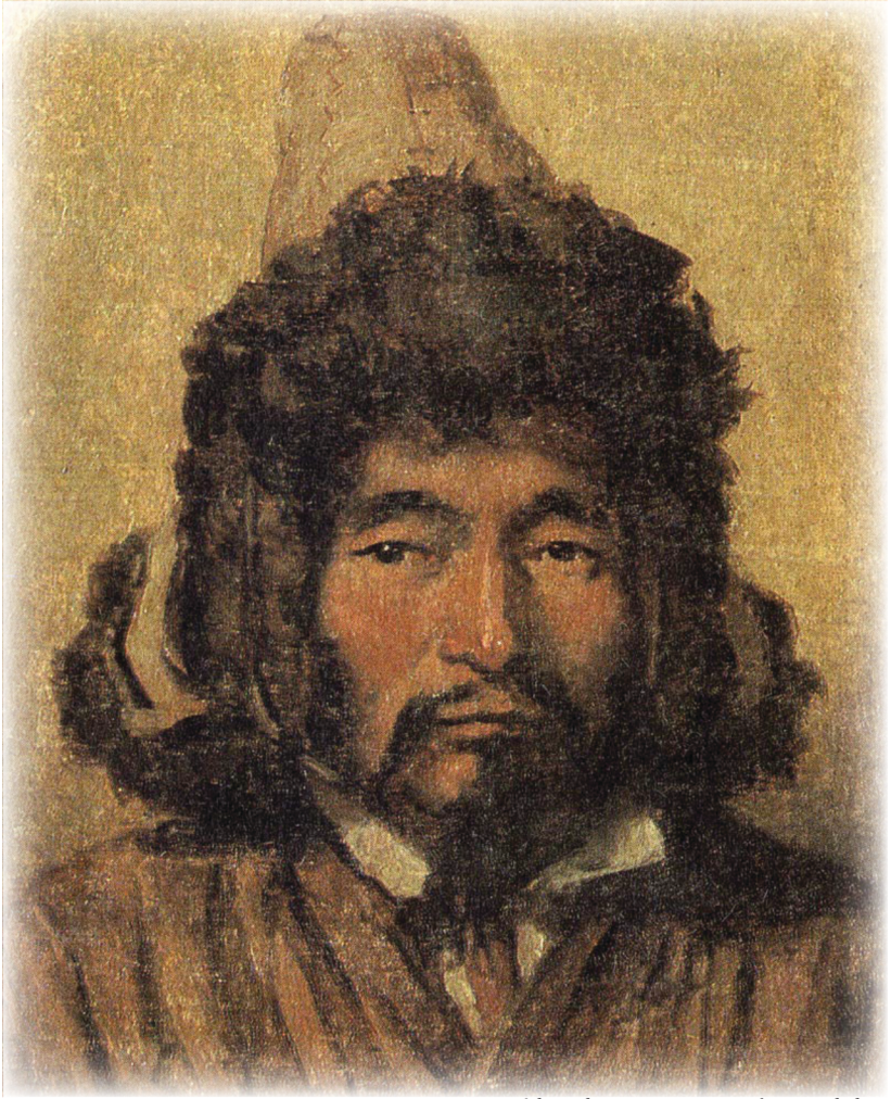
Kazakh with a Fur Hat, Vasily Vereshchagin