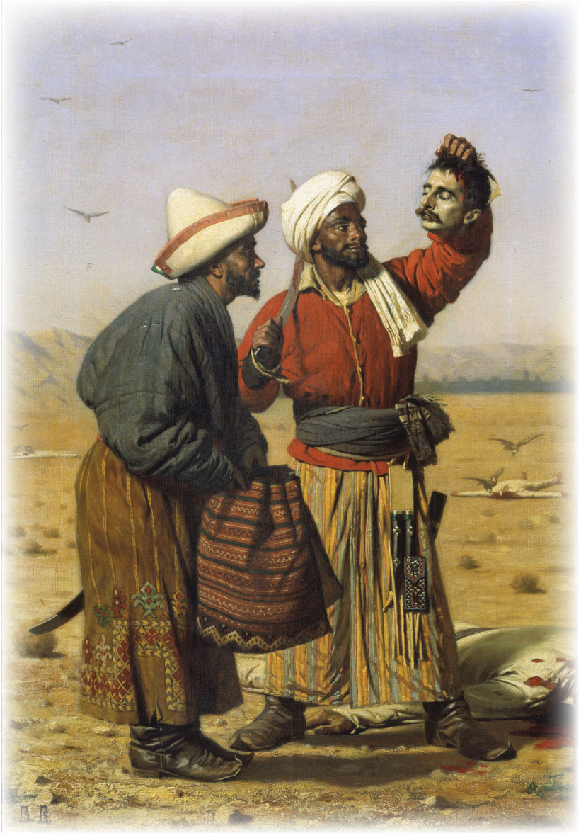
After Good Luck, Vasily Vereshchagin