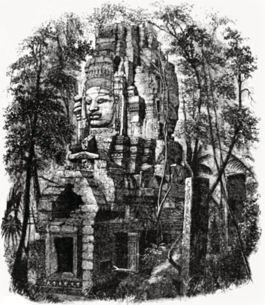
James Fergusson, History of Indian and Eastern Architecture. Vol. 3, 1876